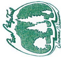
The River Ridge Trail is a co-sponsored project of the Waupaca County Natural Resources Foundation Inc., a nonprofit corporation exempt from federal tax under section 501(c)(3) of the IRS code.

The River Ridge Trail is part of a plan to preserve urban natural areas or "green space" in a non-motorized trail system that winds throughout the Waupaca area. There are several scenic off road trail segments located throughout the city. These segments are connected by streets that are designated with River Ridge Trail signs. Bikes are allowed only on limestone or blacktopped surfaces.